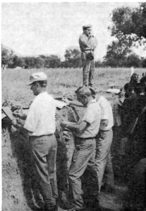
Studying a profile of a Red-Yellow Mediterranean soil derived from shales close to Beja.

In Lisbon, the Mayor of the City received the participants and offered them a cocktail-party. The closure dinner, presided over and offered by the Secretary of State for Agriculture, took place in a typical restaurant of Lisbon.