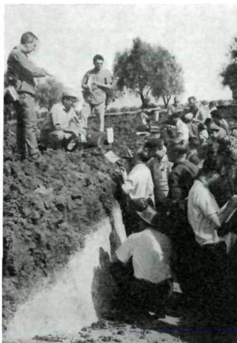
Studying a profile of a Dark Reddish Brown Vertisol derived from basic metamorphic rocks close to Beja.

The region crossed by the participants is already completely surveyed, as the soil survey of Portugal, made at a scale of 1 : 25 000 and published at a scale of 1 : 50 000, covers now about 3,500,000 hectares. Thus, it was possible to see, at each profile site, the respective sheets of the Soils Map of Portugal and the Land Capability Map, what permitted to have detailed information