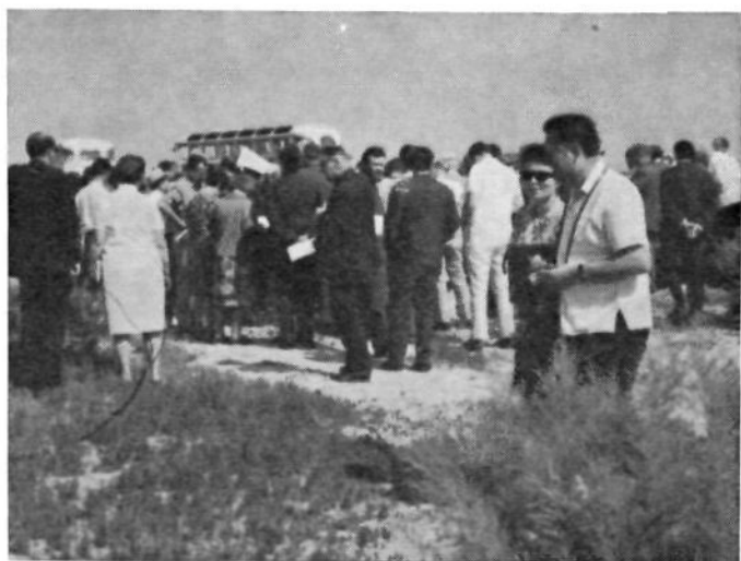
Although the participants did not yet faint from the heat . . . .