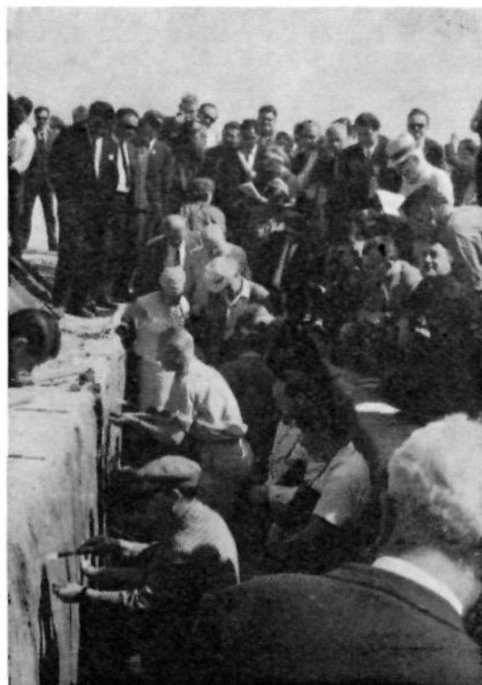
The crowd at the solonchak-profile on the Yeraskhabun Reclamation Station.