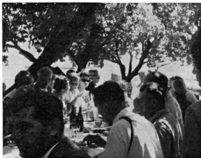
it was a pleasure to relax in the shadow and enjoy Armenian hospitality in the form of a choice of food and drinks.